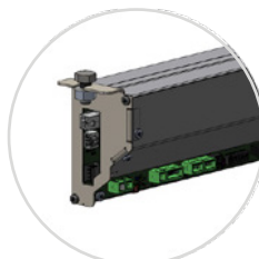
Connectors available on logic box